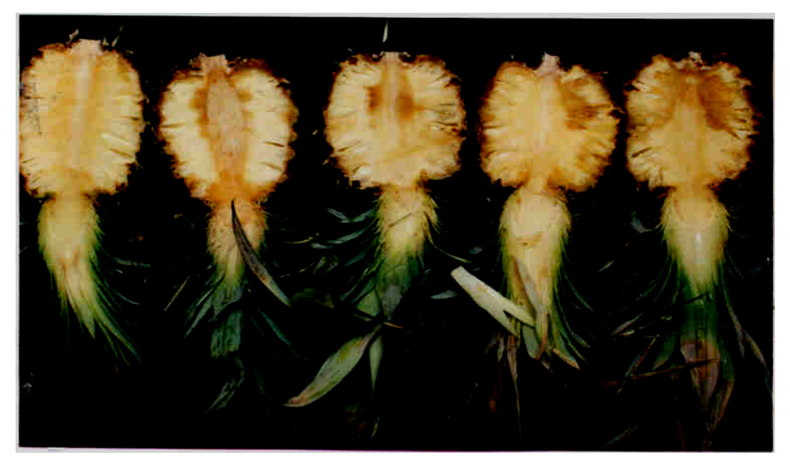
Figure 2. The development of internal browning symptoms in cv. Kew during cold storage (From left to right: Fruit 1 - 7 d of cold storage no visible symptoms; Fruit 2 - 14 d after cold storage showing brown, water-soaked patches in the flesh and in the core; Fruit 3, 4 - 18 d after cold storage with brown, water-soaked patches in the flesh and the core; Fruit 5 - 21 d after cold storage with larger, brown colour, water-soaked areas in core and the flesh tissue)