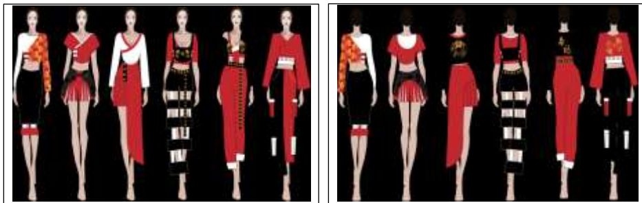
(a) (b) Figure 2: Fashion illustrations of the six final looks from the collection. (a) Front look (b) Back look

In the collection, these colours were reinterpreted in fabrics such as linen and denim, chosen for their tropical suitability and applied through decorative techniques like screen printing, pleating, and asymmetric cutting. Each look reimagines hanbok features (wrap closures, wide straps, pleats) in functional, street-ready forms (Mayhew, 2023).